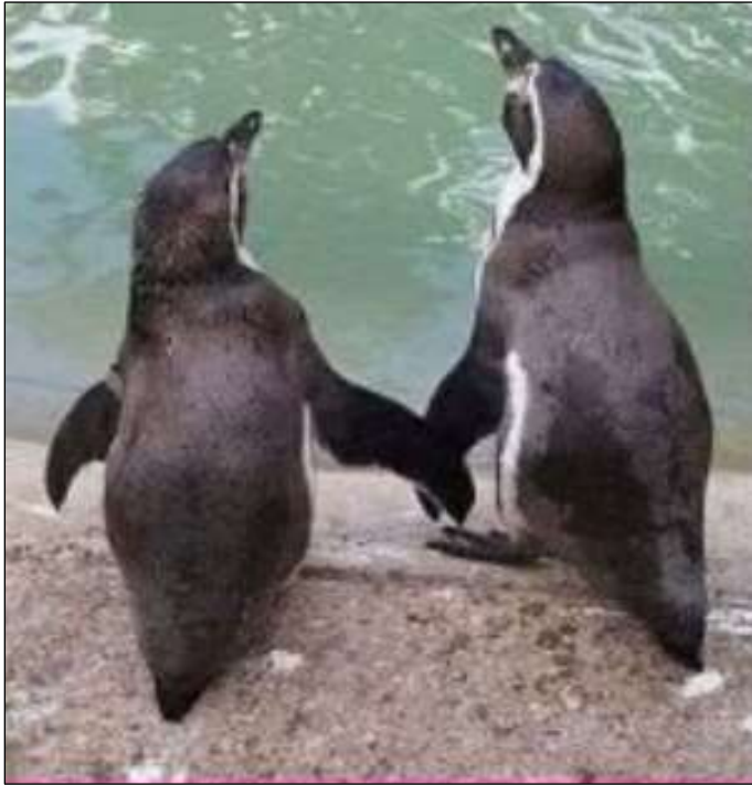
Pictured: A pair of penguins at Sewerby Hall taken from their Twitter page.