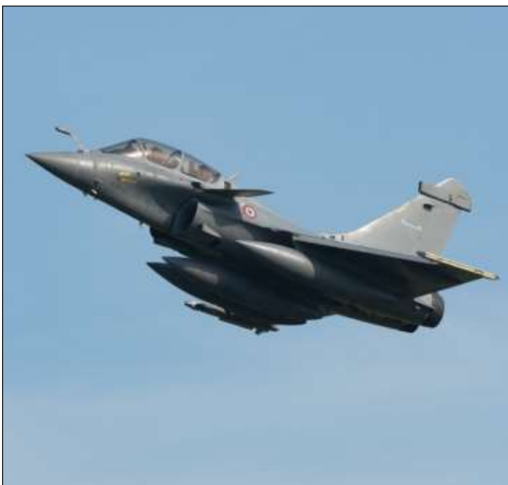
Pictured: A Dassault Rafale jet plane.

A 64-year-old man was given a surprise gift of flight in a Dassault Rafale (meaning burst of fire), a French twin-engine, canard delta wing, multirole fighter aircraft, by his colleagues to celebrate his retirement. Just after the jet had taken off at Saint-Dizier 113 air base, the passenger was ejected from the back of the plane. An investigation into the incident which has just been released by France's Bureau of Enquiry and Analysis for Civil Aviation Safety, has confirmed that he was so startled when the plane took off that he accidentally grabbed the handle that releases the Martin-Baker MK16 ejection seat to steady himself! This caused him to self-eject with his seat, being thrown from the aircraft, he then parachuted down to the ground and landed safely in a field. The pilot performed back-up actions and was then able to land the plane.